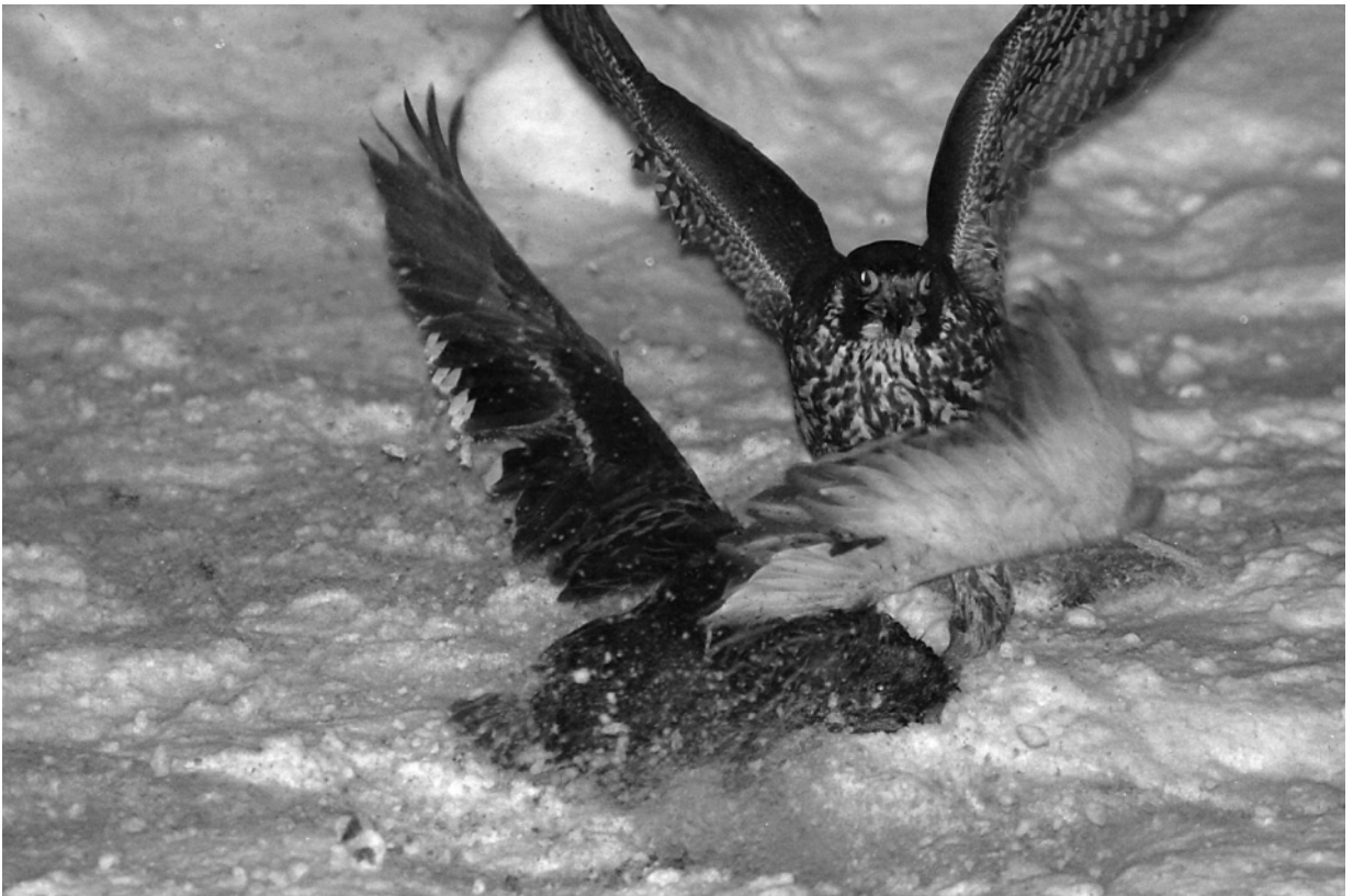
Fig. 2. Peregrine falcon preying on mallard in the dark. Obr. 2. Sokol sťahovavý s kačicou divou, ulovenou v tme.